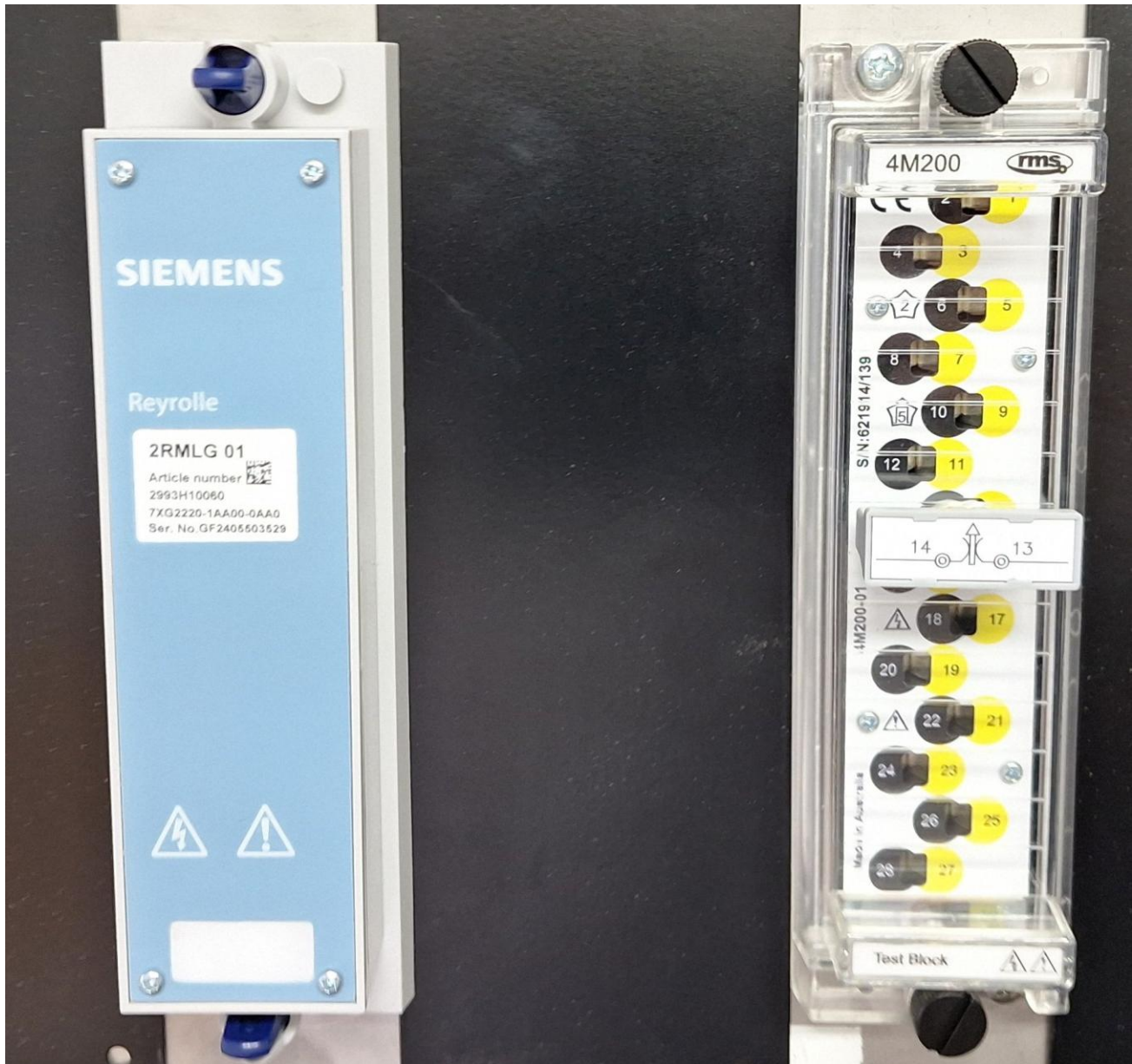
Higher resolution image of old (left) and new block